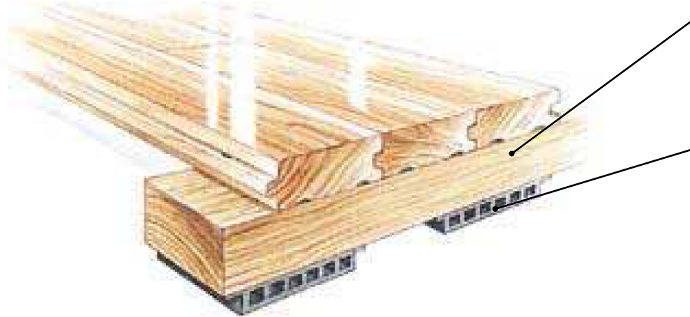
Action Cush Sleepers